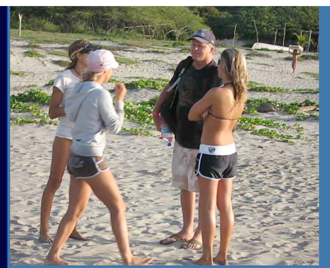
So we sat on the beach and watched the special people come. There were about 8 surfers and two boogie boarders. Here is one of the boogie boarders in the picture below. She couldn't even paddle out past the current.